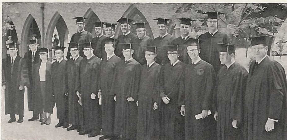
JUNE, 1966, GRADUATES