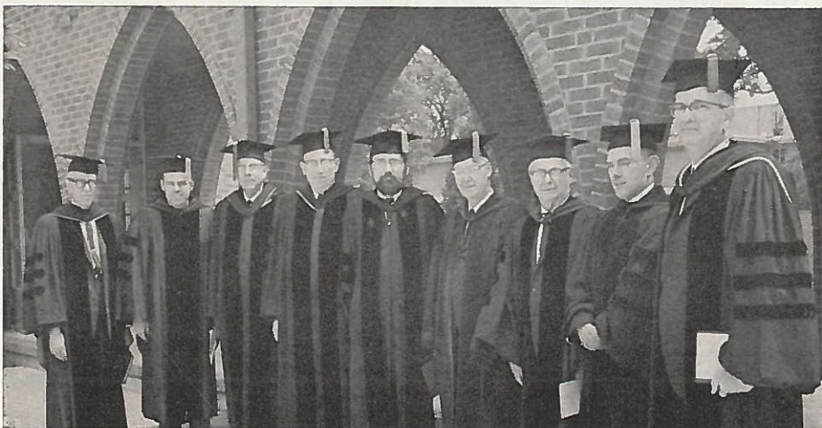
FACULTY PRESENT AT COMMENCEMENT