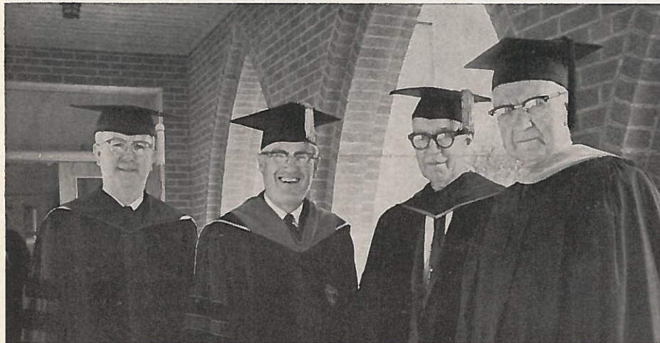
NOTABLES AT JUNE COMMENCEMENT